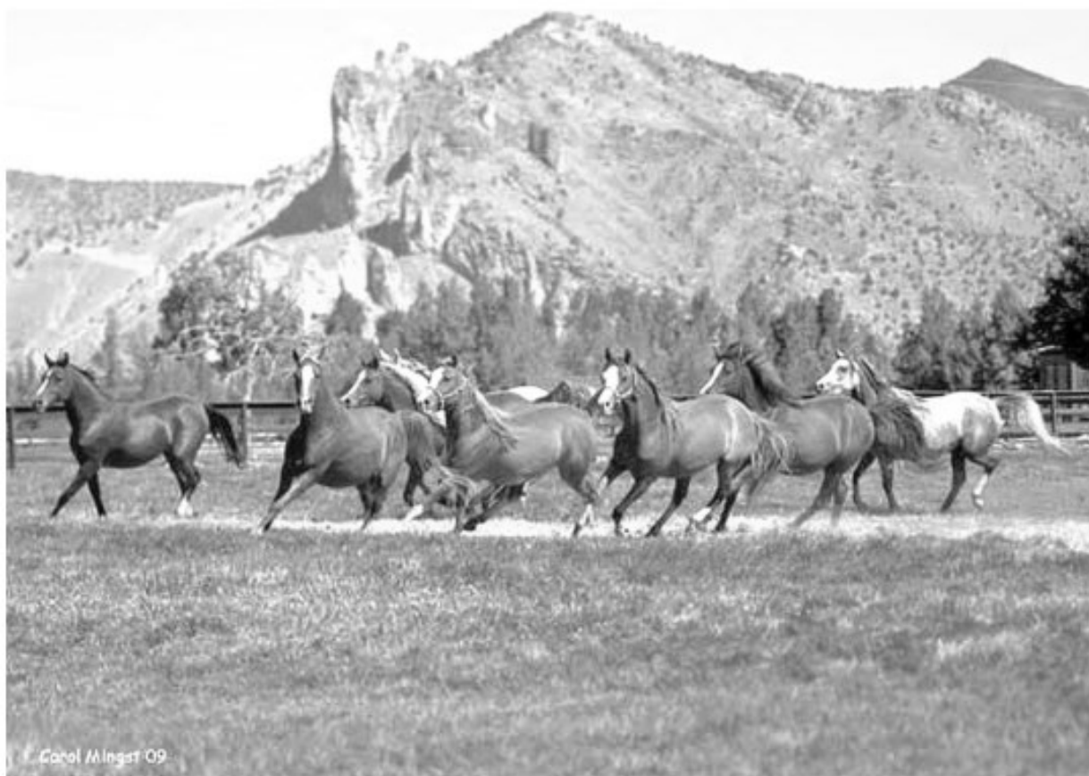
Fillies of Canyonside Ranch