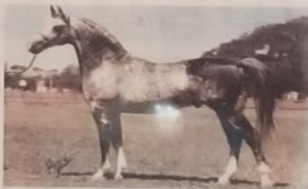
Above: Amerigo. Below: Khemosabi