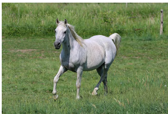
Payback Morning Tide