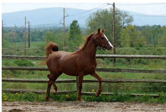
AAA Blazin Celebrity

In spite of his status as an "accumulator" stallion (also like his sire), we were able to get breeding quality doses with some extra effort. We are delighted that both AAA Blazin Celebrity and Payback Morning Tide are in foal to King.