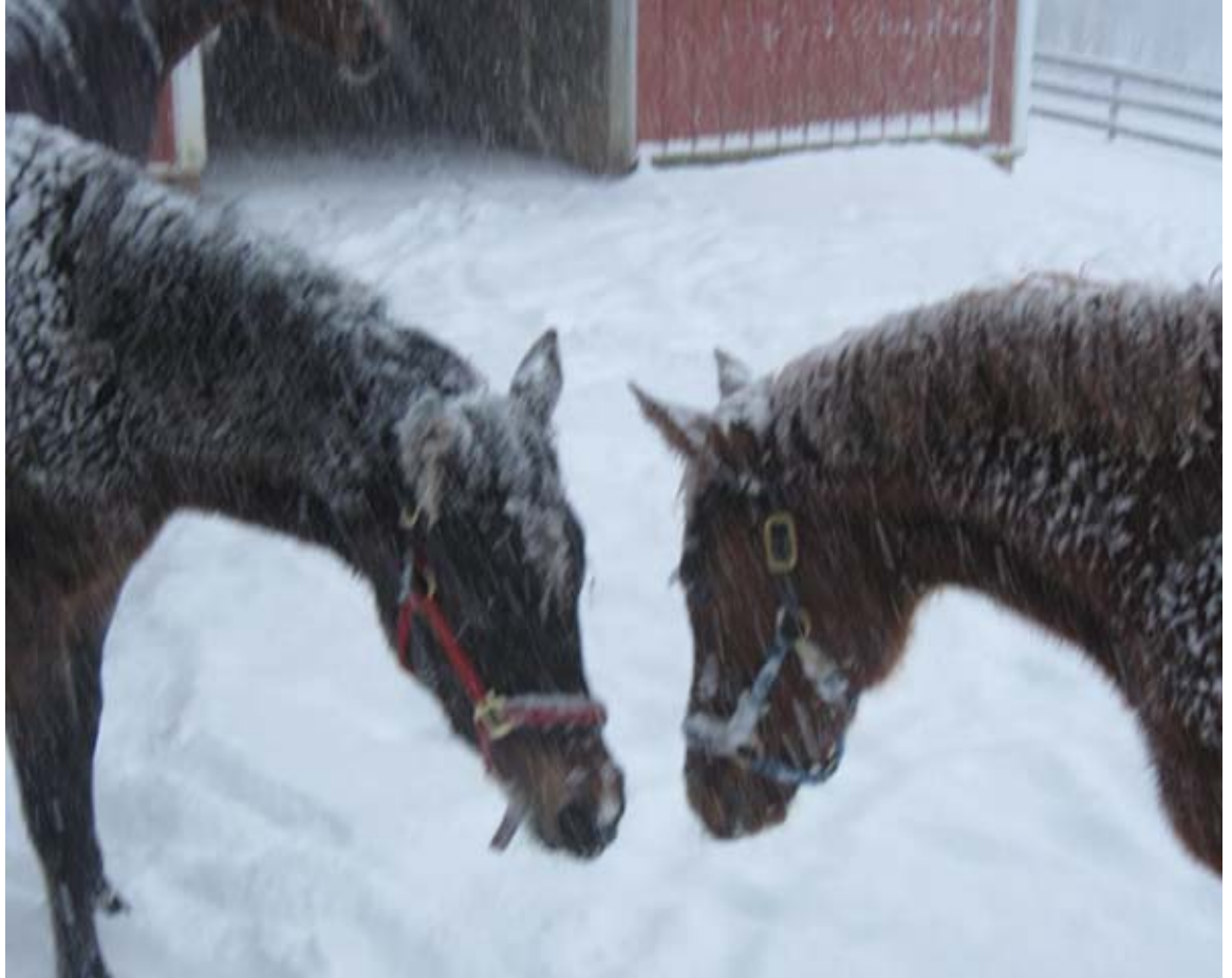
Curly & Cilo