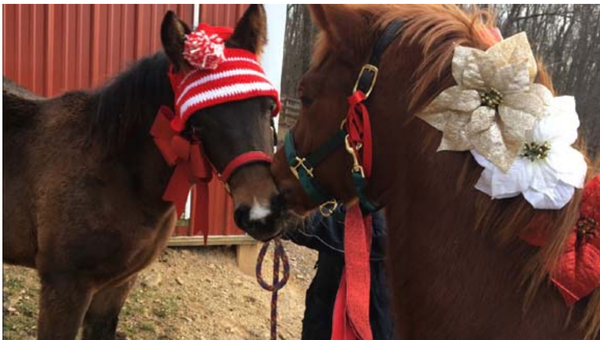
Christmas Curly & Cilo