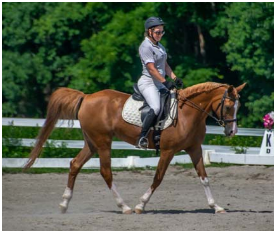
Hidden Creek 1