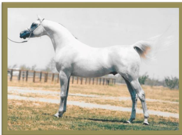
F-Sharp (BF Rageymazon x BF Gallant Lady by Overlook Jordji+++)