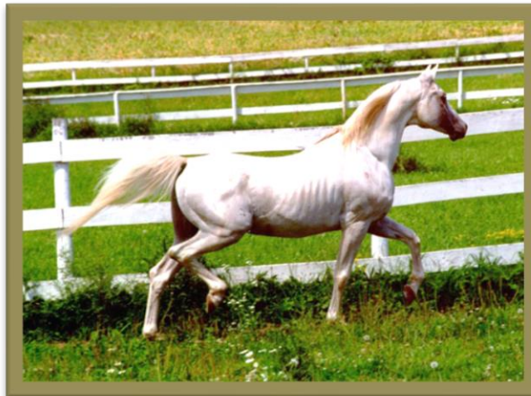
Giborr (PHP Brilliance x Reverie Gida by Wasl Raffles)