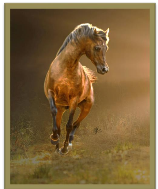
LC Araan (LC Arlington+ +// x Simply Royal by Centurion MM)