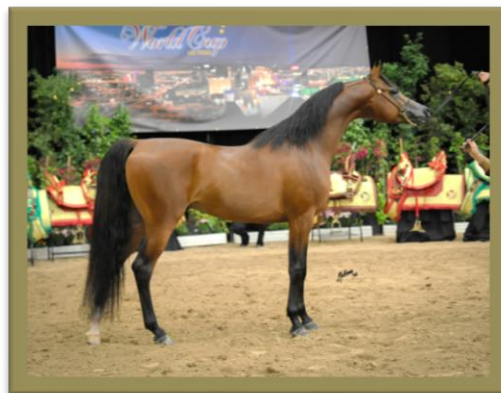
LC Athens (*Regal Actor JP x Genevieve C by Genesis C)