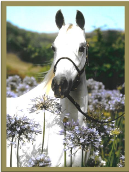
Keeper (FFC Imageyn x Finders Keeper by Llano Grande Couistador)