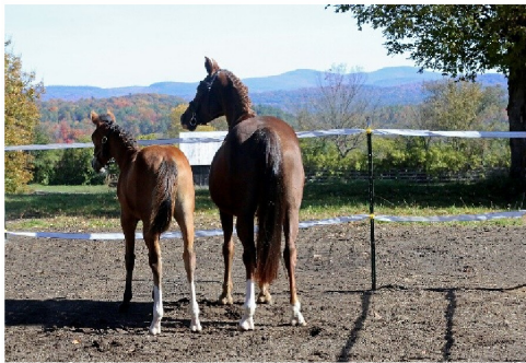
Valkyrie is going to be tall!!