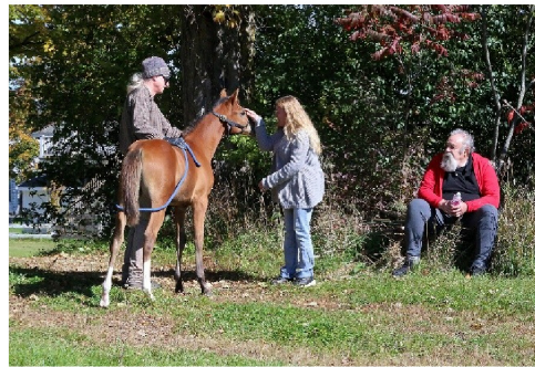
Valkyrie enjoyed meeting everyone

Upon returning home, I was contacted by the ATA because FCF Oberons Vanity was the Reserve Champion Stallion of last year's 2021 ATA Inspection Tour. It's pretty cool that an Arabian was the second highest scoring stallion of the whole inspection tour!! The ATA folks were hoping I'd be at the ATA's Annual Convention in Tryon in early November to accept that award, but unfortunately I'm not able to attend. They'll ship the award to me soon!! (Since their inspection tours conclude at the convention, they give out the annual inspection awards at the following year's convention.)