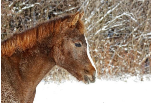
FCF Titans SilverAura (Aur Elijah x FCF Titanias Vanity) gray colt 84.88% Crabbet/Blunt

Greetings from Vermont! We briefly had some lovely snow that the horses enjoyed just before Christmas. Here are the 2022 foals in their first snow: