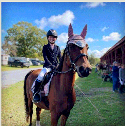
Acorns Mysterium OLA at a local show

Several local youth riders are doing well with horses connected to our breeding program. This fall they've been attending horse shows and learning cross country jumping.