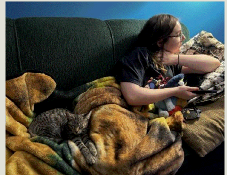
Charm with daughter

Several local youth riders are doing well with horses connected to our breeding program. This fall they've been attending horse shows and learning cross country jumping.