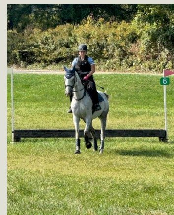
Sunny (Anglo-Arab) schooling cross country jump