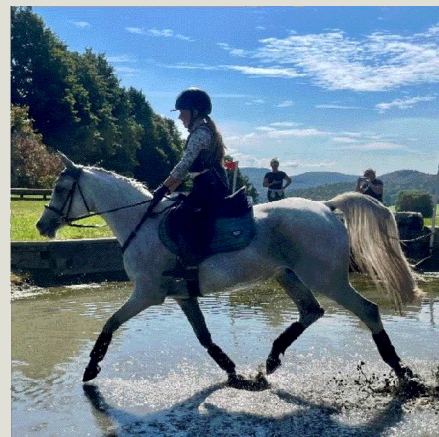
FCF Pucks Vision schooling cross country water obstacle