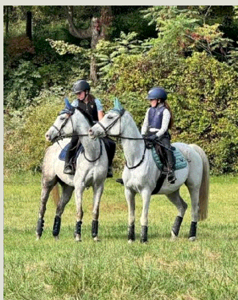
Sunny (AA) and FCF Pucks Vision (Arab) both by FCF Oberons Vanity