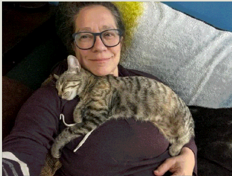
Zelda with the mom