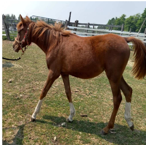
Dawning Brynns Rhoda 2024 chestnut filly