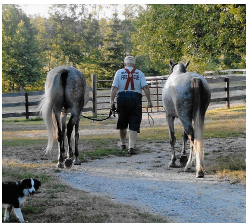
Buzz- The End