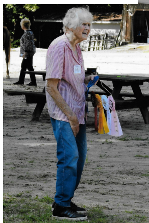
Miss Virginia with Show Ribbons ECAHS 2018