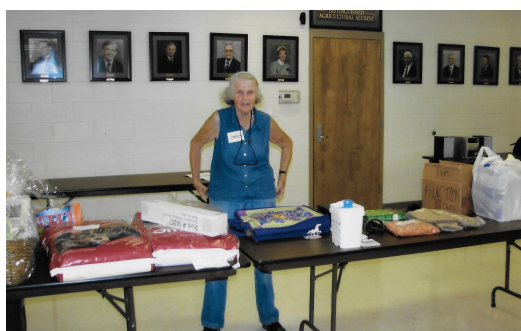
Miss Virginia And Auction ECAHS 2017