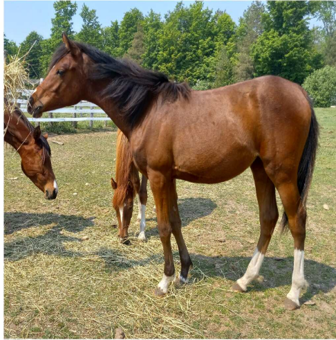
Dawning Brynns Rhea 2022 chestnut filly